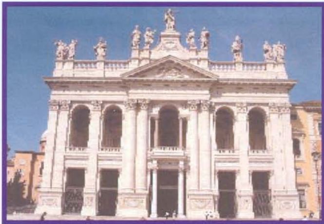
Basilica of St. John Lateran: Rome

St. John Lateran is more closely connected with the life of Francis and the whole Franciscan movement than any other place in Rome. In 1209 Francis and his first companions came here to have their way of life confirmed. Pope Innocent III gave verbal approval to the brothers, tonsured them, and commissioned them to preach penance. This fact is so vital because if Francis had not come to Innocent there would be no Franciscan family today. For this reason St. John Lateran is called the Baptistry of the Franciscan movement, the place where the Franciscan family was born into the Church.