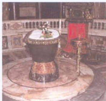
Baptistry at St. John Lateran, Rome

St. John Lateran is more closely connected with the life of Francis and the whole Franciscan movement than any other place in Rome. In 1209 Francis and his first companions came here to have their way of life confirmed. Pope Innocent III gave verbal approval to the brothers, tonsured them, and commissioned them to preach penance. This fact is so vital because if Francis had not come to Innocent there would be no Franciscan family today. For this reason St. John Lateran is called the Baptistry of the Franciscan movement, the place where the Franciscan family was born into the Church.