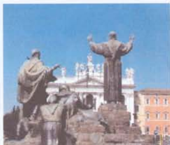
Francis Holding Up the Church. Monument built by Benito Mussolini 1926

To answer the question "Why did Innocent listen to Francis?" the above reasons are compelling. Francis had no hidden agenda. All he desired was to imitate Christ and this completely disarmed any adversaries. To say no to Francis would have seemed like saying no directly to Christ. And because of his rootedness in Christ, Francis could embrace the Church as an institution, despite her shortcomings. To embrace the Church, for Francis, was to embrace Christ.