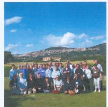
God is present in each of us.