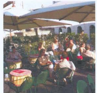
Piazza Comune: Intimate Moments.