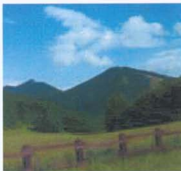
Mountains and fields: Rieti Valley

The General Constitutions, no. 24, offer further encouragement: Secular Franciscans should consider their own family to be the first place in which to live their Christian commitment and Franciscan vocation. ... Married couples find in the Rule of the SFO an effective aid in their own journey of Christian life, aware that, in the sacrament of matrimony, their love shares in the love that Christ has for his Church. The way spouses love each other and affirm the value of fidelity is a profound witness for their own family, the Church, and the world.