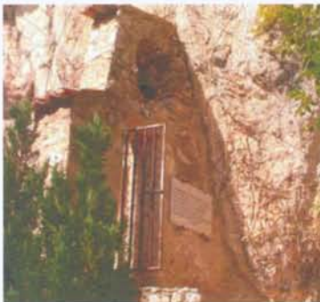
Mountain Hermitage: Poggio Bustone.