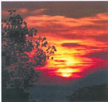
Meeting God in a sunset