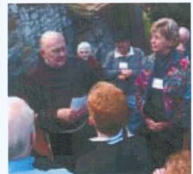
Pilgrims listen to a lecture: San Damiano