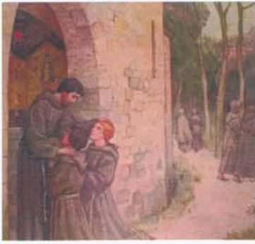
The joy of a common vision.