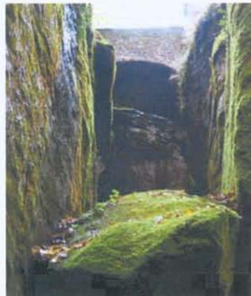
God in the ruggedness of LaVerna.

Cave at Greccio where Francis renewed Bethlehem.