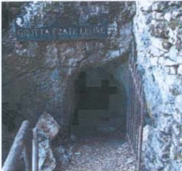
Moments of quiet: a cave at Carceri.