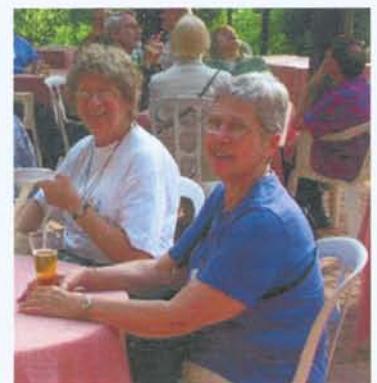
God is discovered as we open our hearts.