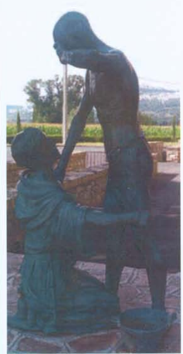
Francis and a leper: Rivo Torto