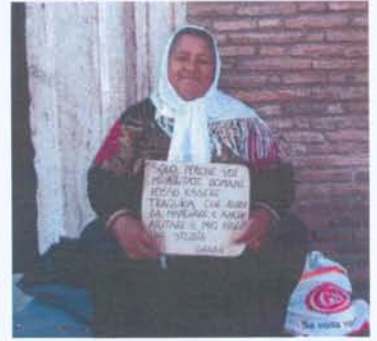
Beggar at St. John Lateran.