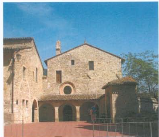
Sanctuary of San Damiano, Assisi, Italy